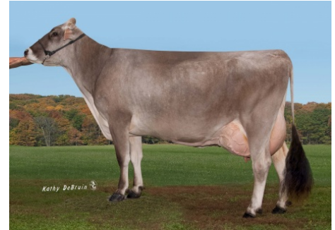
Dam: Switzer Tals Alibaba Davos 'VG 86 VG 86MS' Dam of 54BS544 DARIO