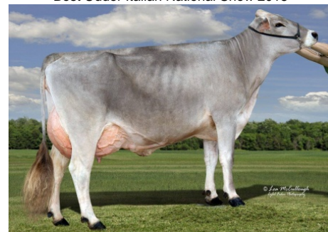
VB River Brookings Zaphina ET

NEW GENERATION GENETICS www.brownswiss.com (920) 568-0554 E-mail: info@brownswiss.com